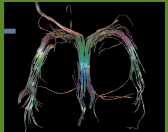
BELOW: Coronal image of the fornices in a normal 9-year-old. The blue in the middle shows the column, green at the convergence shows the body, purple on the edges show the crura and the fibers on the sides show fimbria.